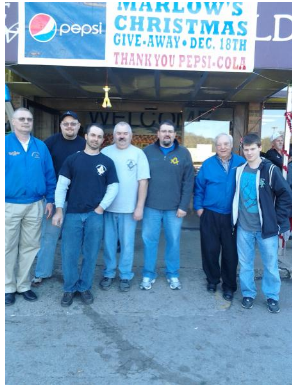
Our Lodge volunteered to work Marlow's Christmas Giveaway for the needy in Whitesburg.